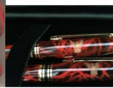
1991 WJ w/lanyard