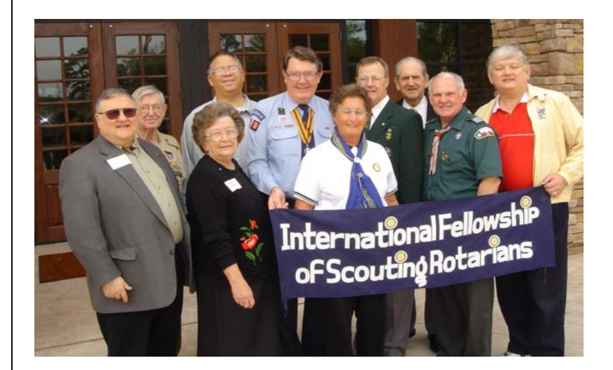
Group Photo of Attendees

The group was invited to have lunch with the Houston council's Wood Badge training troops and leaders preparing for the up-coming Wood Badge Courses (3) to be held in the Sam Houston Area Council during the next few months.