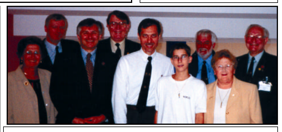
PHOTO: Scouting Rotarians and family members at Lord Baden-Powell's House in London.