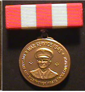
Eisenhower Waste Paper