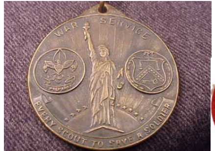
War Bonds Treasury Award