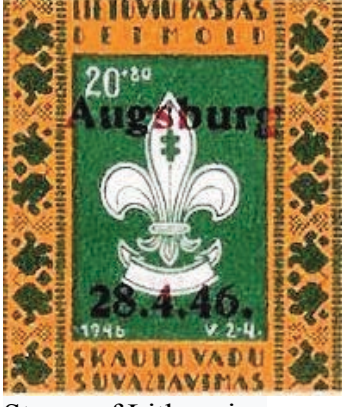
Stamp of Lithuanian Scout postal system