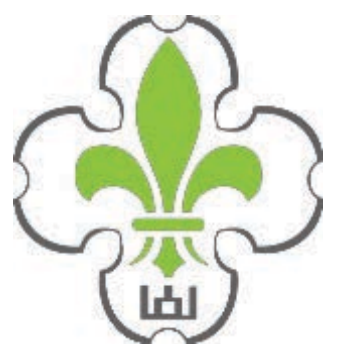
Lietuvos skautija Membership Badge