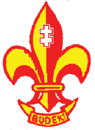
Historic Membership Badge