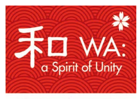
23<sup>RD</sup> WORLD SCOUT JAMBOREE Kirara-hama, Yamaguchi, Japan