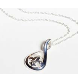
W.B. watch World Bureau necklace 1987WJ