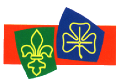
Swiss Guide and Scout Movement