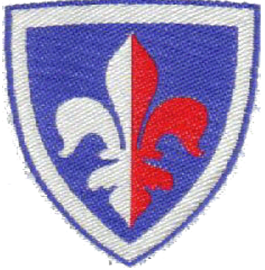
The historical membership badge of the Schweizer Pfadfinderbund

The Swiss Guide and Scout Movement (SGSM), in the three official languages of Switzerland ( Pfadibewegung Schweiz (PBS ), Mouvement Scout de Suisse (MSdS) , Movimento Scaut Svizzero (MSS) , Moviment Battasendas Svizra (MBS) ), is the national Scouting and Guiding association of Switzerland. Scouting was founded in Switzerland in 1912 and has 45,000 members in 600 local groups as of 2010. The Swiss Guide and Scout Movement is mixed at all levels.