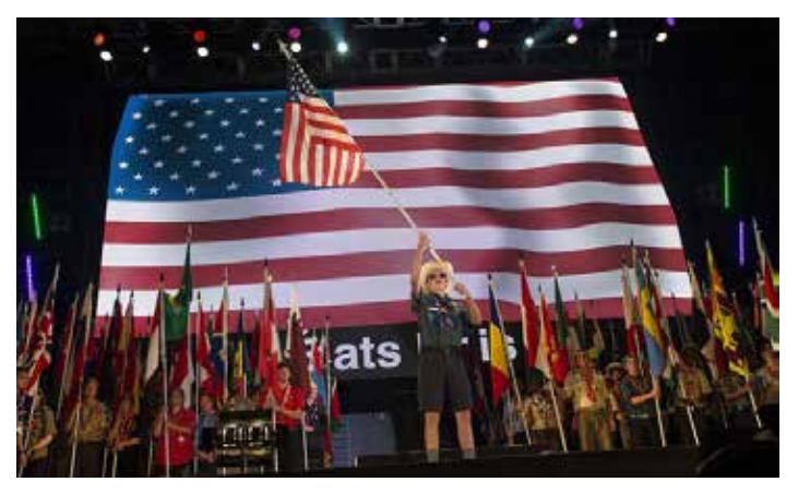
In late July, the Boy Scouts of America sent approximately 1,600 youth, leaders, and staff to the 2015 World Scout Jamboree in Japan.