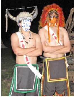
OA Calling-Out Ceremony