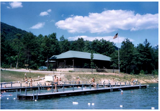
Lake Good & Camp Shikellamy Dining Hall in 1960